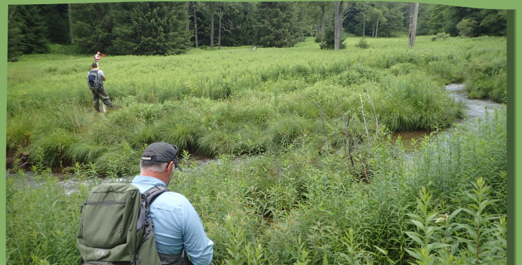
Wetland Habitat Assessment