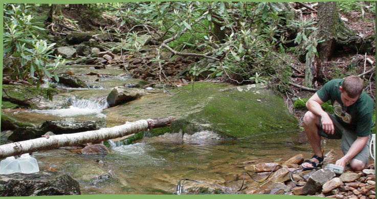
Evaluating Stream Water Quality