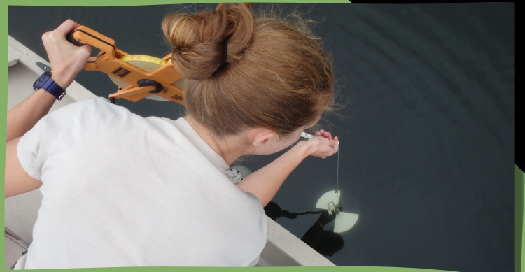
Evaluating Water Column Turbidity