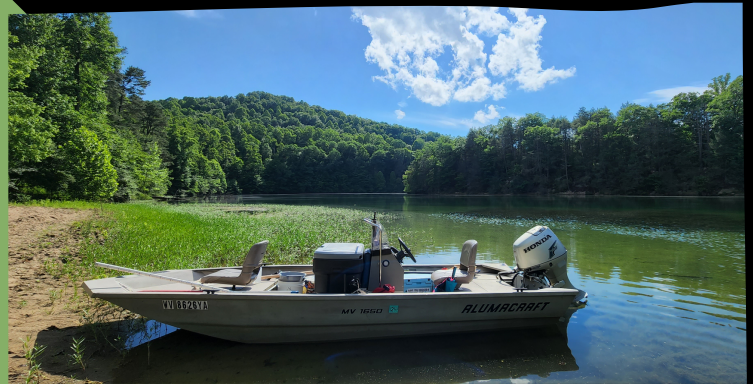
Boatable Lake Assessment