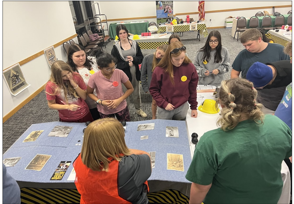
Youth Conference attendees participate in an Environmental Escape Room at Twin Falls State Park.