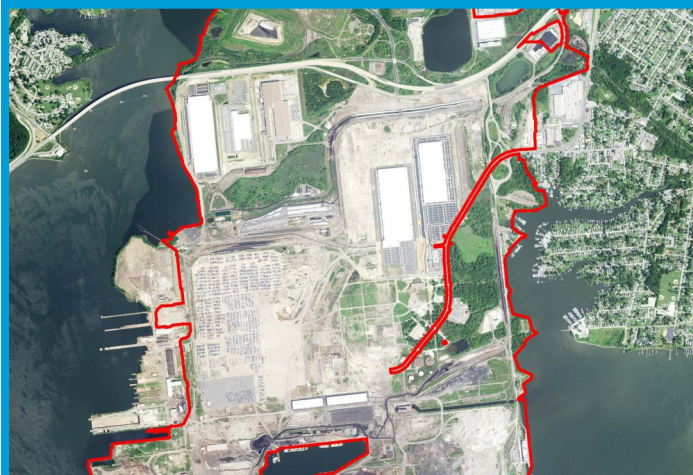
An aerial view of the Sparrows Point Site in 2018.

The Sparrows Point Site, a 3,100-acre peninsula reaching into the Baltimore Harbor in Baltimore County, Maryland, was home to one of the world’s largest steel manufacturing operations for more than 100 years. Steel manufacturing created thousands of jobs, but also resulted in significant contamination at the facility and in offshore areas. Beginning in the mid-1990s, the EPA and the Maryland Department of the Environment (MDE) were actively involved in addressing the contamination under RCRA. A variety of owners and operators were also involved through judicial and bankruptcy proceedings.