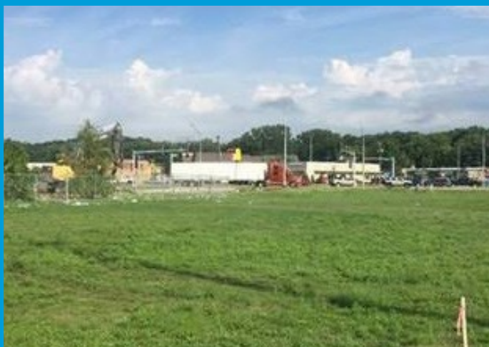
A view of the Armour Road site.

The 1.8-acre Armour Road Superfund site is located in North Kansas City, Missouri. From 1929 to 1986, an herbicide-blending facility operated on the site and resulted in arsenic contamination in the soil and groundwater. The site was referred to the EPA in 1996 and the Agency conducted a non-time critical removal to excavate and dispose of contaminated soil. The remedial action at the site has been expedited by coordination between the EPA and the PRP. For example, the EPA issued comfort letters to North Kansas City and prospective businesses. These comfort letters informed interested parties on the status of the site, including how the site can and cannot be reused. Today, the former industrial area is growing into a mixed-use urban center filled with hotels, apartments, restaurants, and a medical center. Coordination on the redevelopment of this property has been most recently recognized in a ceremony whereby the Regional Administrator presented Leading Environmentalism and Forwarding Sustainability (L.E.A.F.S.) Awards to the Mayor of North Kansas City and others committed to sustainable development.