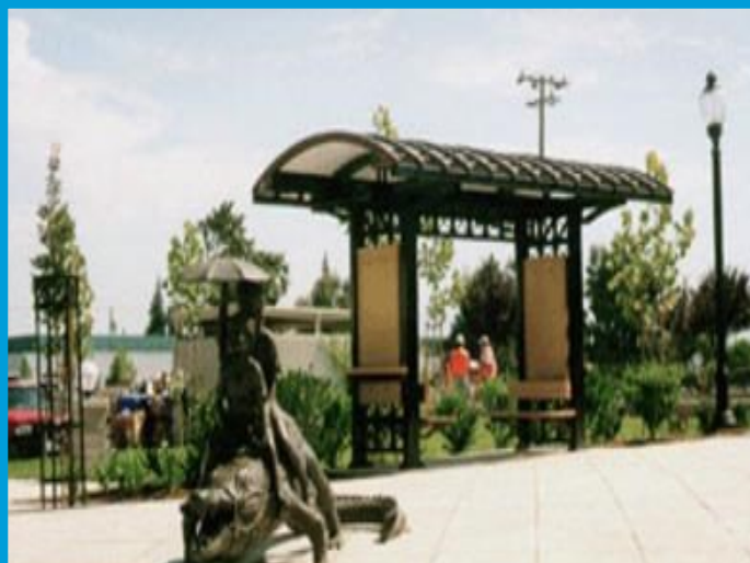
A sculpture and waiting area at a new company campus on site.

In Mountain View, the Middlefield-Ellis-Whisman Superfund Study Area (or MEW Site) is comprised of three Superfund sites: Fairchild Semiconductor Corp., Raytheon Company, Intel Corp., several other facilities and portions of the former Naval Air Station Moffett Field. In 2017, the EPA and DOJ entered into a BFPP agreement with Warmington Fairchild Associates LLC to accelerate cleanup and significantly reduce subsurface contamination in a short timeframe at three parcels in the MEW Site. The BFPP agreement also ensured residential redevelopment in a manner protective of human health for future occupancy. Upon completion, the redevelopment at the MEW Site will include 22 townhomes and four detached homes. The Fairchild Semiconductor Corp. site is now in reuse as an office complex for a major multi-national technology company. The Raytheon Company site currently hosts various business and commercial offices, light manufacturing facilities and the headquarters for an information security, storage and systems management solutions company. The Intel Corp. site is currently home to commercial businesses and headquarters for a software company.