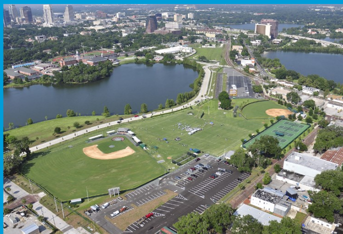
An aerial view of the recreation facilities on site.

Working relationships and innovative settlement agreements led to the cleanup of the Former Spellman Engineering site and reuse of the adjacent Lake Highland property in Orlando, Florida. In 2008, the EPA and the city of Orlando (the City) signed the nation’s first CPO agreement, in which the City agreed to voluntarily implement the site’s estimated $12.9 million remedy. Lake Highland Preparatory School (LHPS) also worked with the City to finalize the project’s Sale and Purchase agreement and with the City, the EPA and Florida Department of Environmental Protection to finalize Prospective Purchaser Agreement and Brownfield Site Rehabilitation agreements that addressed potential liability concerns and facilitated the property’s reuse. LHPS has reused part of the Lake Highland property for sports fields and parking and has plans for a gymnasium and maintenance facilities. The Dinky Line segment of the Orlando Urban Trail, a paved recreation trail, now extends through the area. Commercial and industrial businesses are located on part of the site. The City and the Orlando Utilities Commission are also exploring opportunities for mixed-use redevelopment on the property.