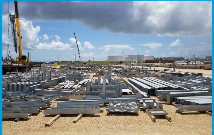
An on-site storage and laydown facility.

The 140-acre Tex Tin Corp. Superfund site is located near the banks of Galveston Bay in Texas City, Texas. Historical smelting operations contaminated soil, sediment and groundwater with hazardous chemicals. Cleanup at the site addressed contaminated groundwater, soil and sediment, waste piles, wastewater treatment ponds, acid ponds and slag piles. After cleanup, the EPA awarded the site a Superfund Redevelopment Program grant in 2001.